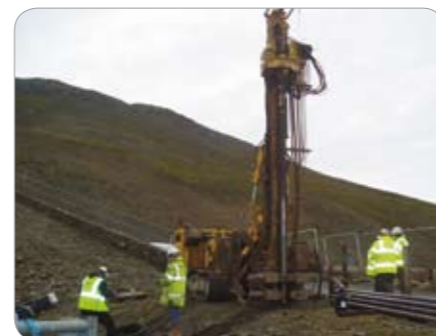
Keller – Wales Grout curtain creation at Marchlyn Mawr-Reservoir, Wales.