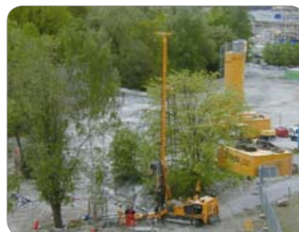
Södra Länken, Stockholm – Sweden Ground water infiltration prevention at Södra Länken high-way link.