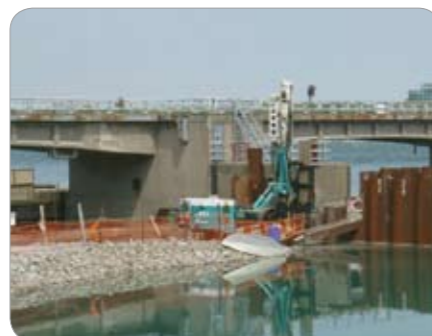
Niagara – Canada Construction of foundations for an 11 km long turbine tunnel.