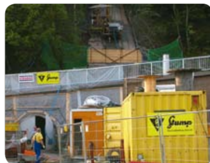
Ohra Dam, Oberhof – Germany Drilling of grout holes at the Ohra Dam.