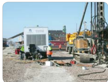
Malmö Citytunnel – Sweden Ground water screening during the construction of the City Tunnel.