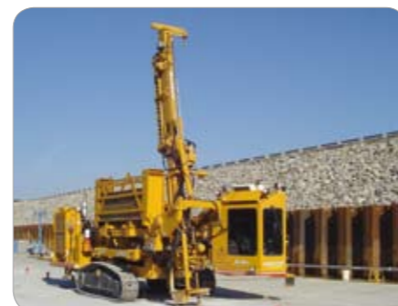
Wolf Creek Dam, Kentucky – USA Installation of grout curtain to prevent seepage.