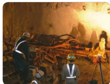
Chikushi tunnel – Japan Drilling of 200 m long horizontal survey holes.