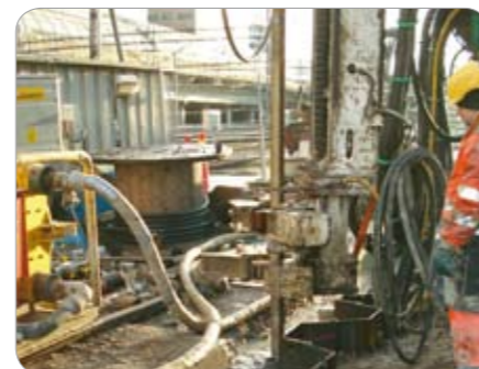
Citybanan, Stockholm – Sweden Construction of a ground water cut-off wall at the Central Station.