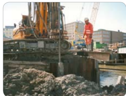
Göteborg – Sweden Foundations in water rich formation.